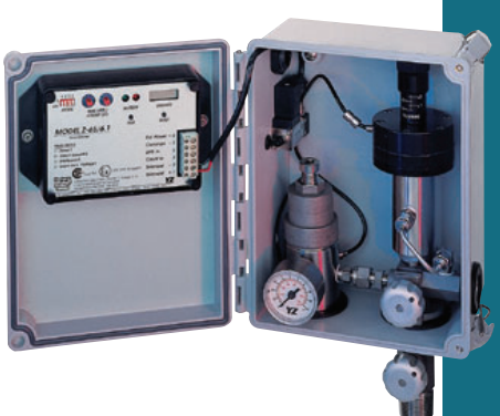
The DynaPak Series is not only compact, but simple to select. The DynaPak 2000 Series if a good fit for gas and the DynaPak 3000 fits liquid applications

At-a-glance inspection of sample strokes can be made using the on-board six-digit counter. Our SmartSite™ constant pressure sample cylinder can provide data on the sampling volume for remote monitoring to your Flow Computer, RTU or SCADA system. Increased data and analysis allows for a new level of productivity in your operation.