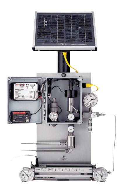
DynaPak 3010 with SlipStream and Constant Pressure Sampler Cylinder.